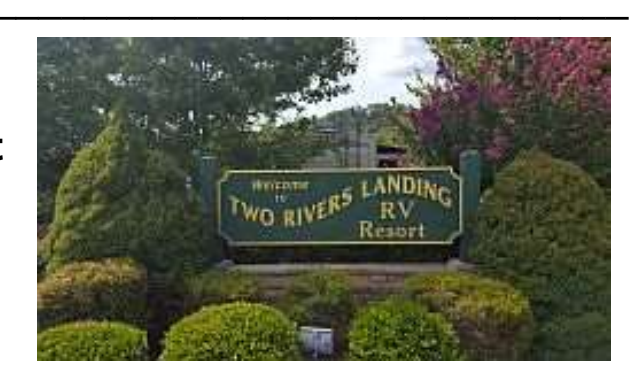
Hosts: Greg & Rose Zaic Dorris & Ethel Carpenter

Two Rivers Landing RV Resort is a luxury RV Resort nestled along the banks of the beautiful French Broad River located in the peaceful green valley of Sevierville, Tennessee. It is an exclusive luxury RV resort with amenities just minutes from the Great Smoky Mountains National Park, Gatlinburg, Pigeon Forge and Cade's Cove. You can spend your days hiking in the mountains, driving to one or more of the many lookout points located in the Great Smoky Mountains National Park where you will