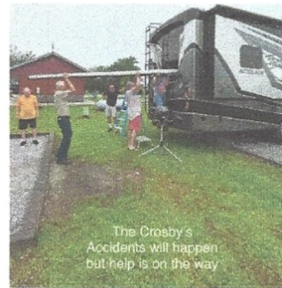
The Crosby's Accidents will happen but help is on the way