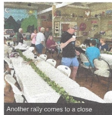
Another rally comes to a close