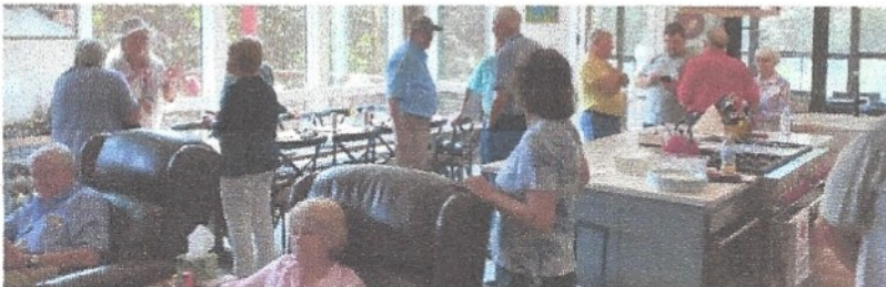
Brunch at the Phillips