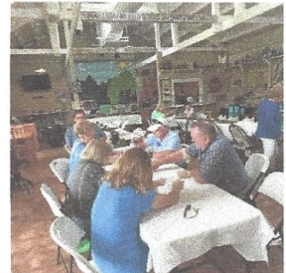
Games people play, where are the Fast Trackers?