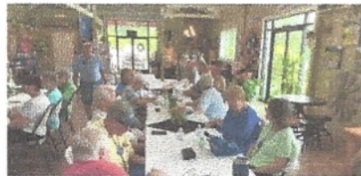
Meet & Greet and pizza dinner