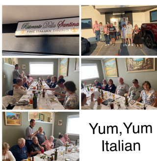
Yum, Yum Italian