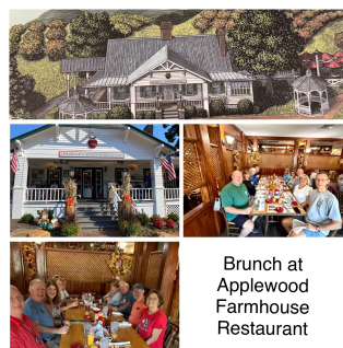
Brunch at Applewood Farmhouse Restaurant